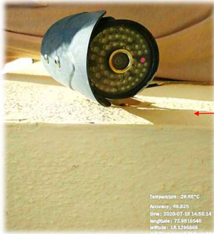
CCTV Camera (Close View)