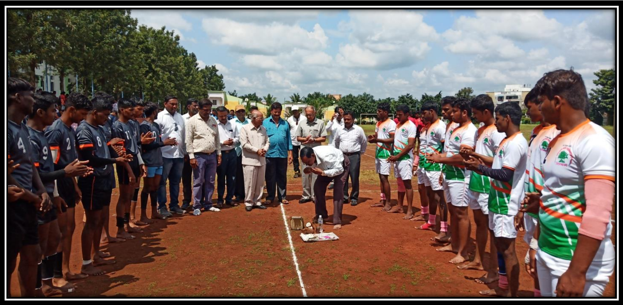
2. Kabaddi Boys Team Participation In Inter Colligate Competition.